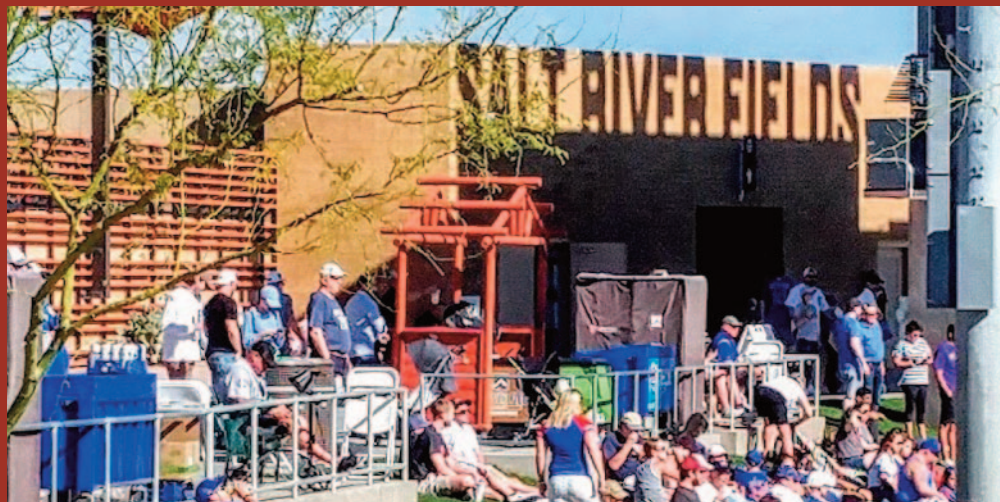
Salt River Fields

Still the first and only MLB facility built on Native American Land, Salt River Fields at Talking Stick (7555 N. Pima Rd. Scottsdale, 480.270.5000, www.saltriverfields.com ) is the shared spring training home and minor league operations headquarters of the 2023 National League Champion Arizona Diamondbacks and Colorado Rockies since 2011. Because two teams share the facility, there is a game being played just about every day on the Cactus League schedule From February 23 – March 24. The Diamondbacks and Rockies begin the Cactus League season with games against each other on February 23-24. A 2023 World Series rematch between the Diamondbacks and American League and World Series champion Texas Rangers is scheduled for February 27.