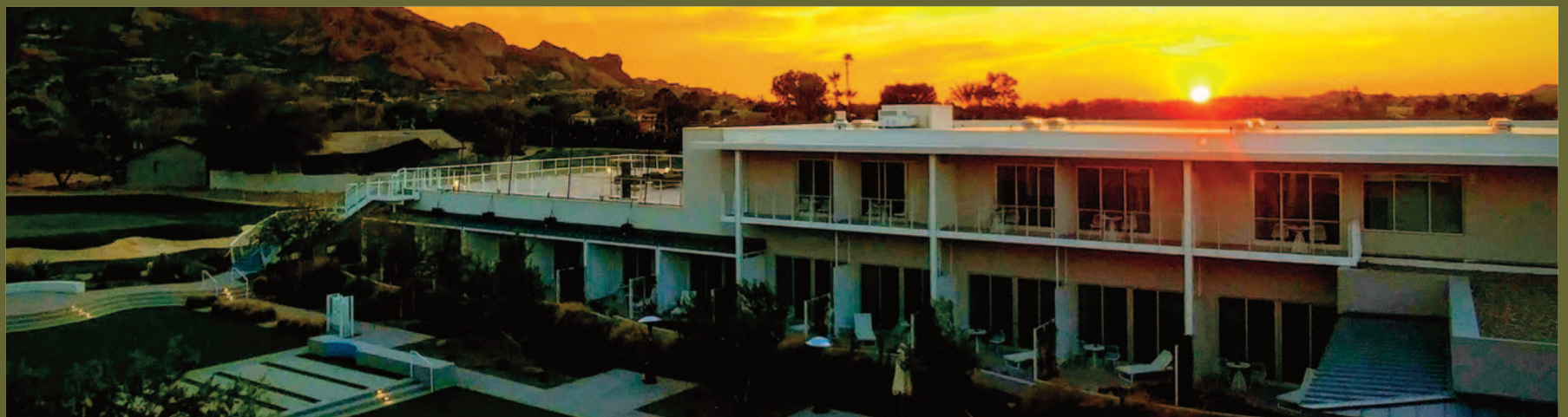
Mountain Shadows Resort

For ambitious early risers the proximity of Camelback Mountain provides an alluring and inspirational backdrop to the Mountain Shadows resort and the hotel provides shuttle service to the mountain's Echo Canyon Trail for ambitious early risers.